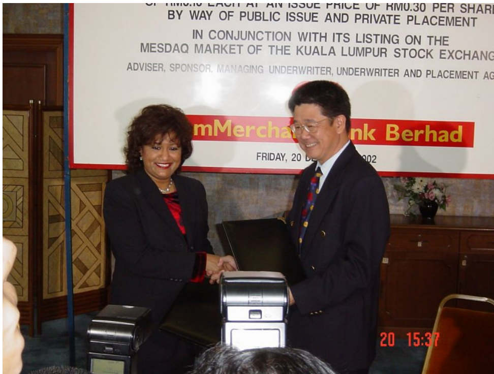
Figure 2: Ceremony of Exchanging Documents