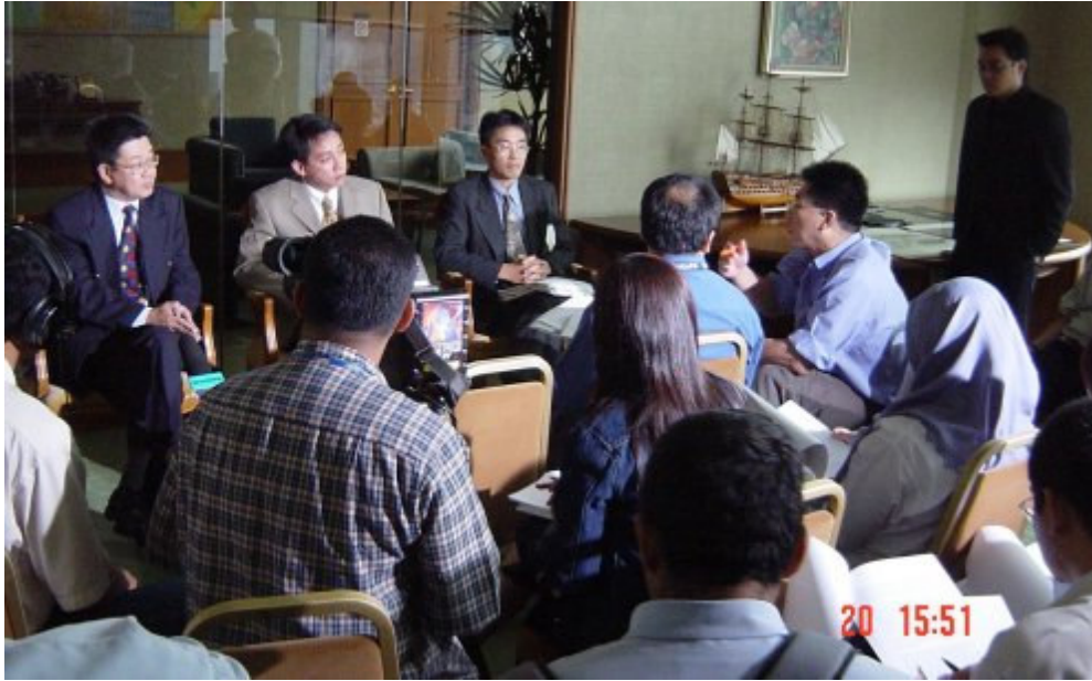
Figure 3: Press Conference