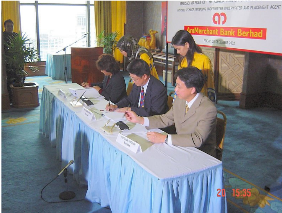
Figure 1: Ceremony of Signing Agreement